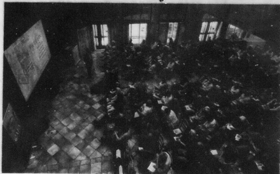
Families affected by dementia are invited to a free educational conference on May 15 in Salt Lake City sponsored by the Alzheimer's Foundation of America.